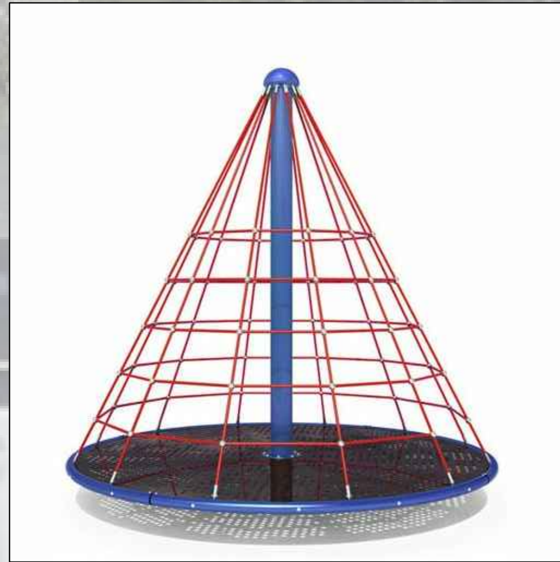
27 PLAY EQUIPMENT