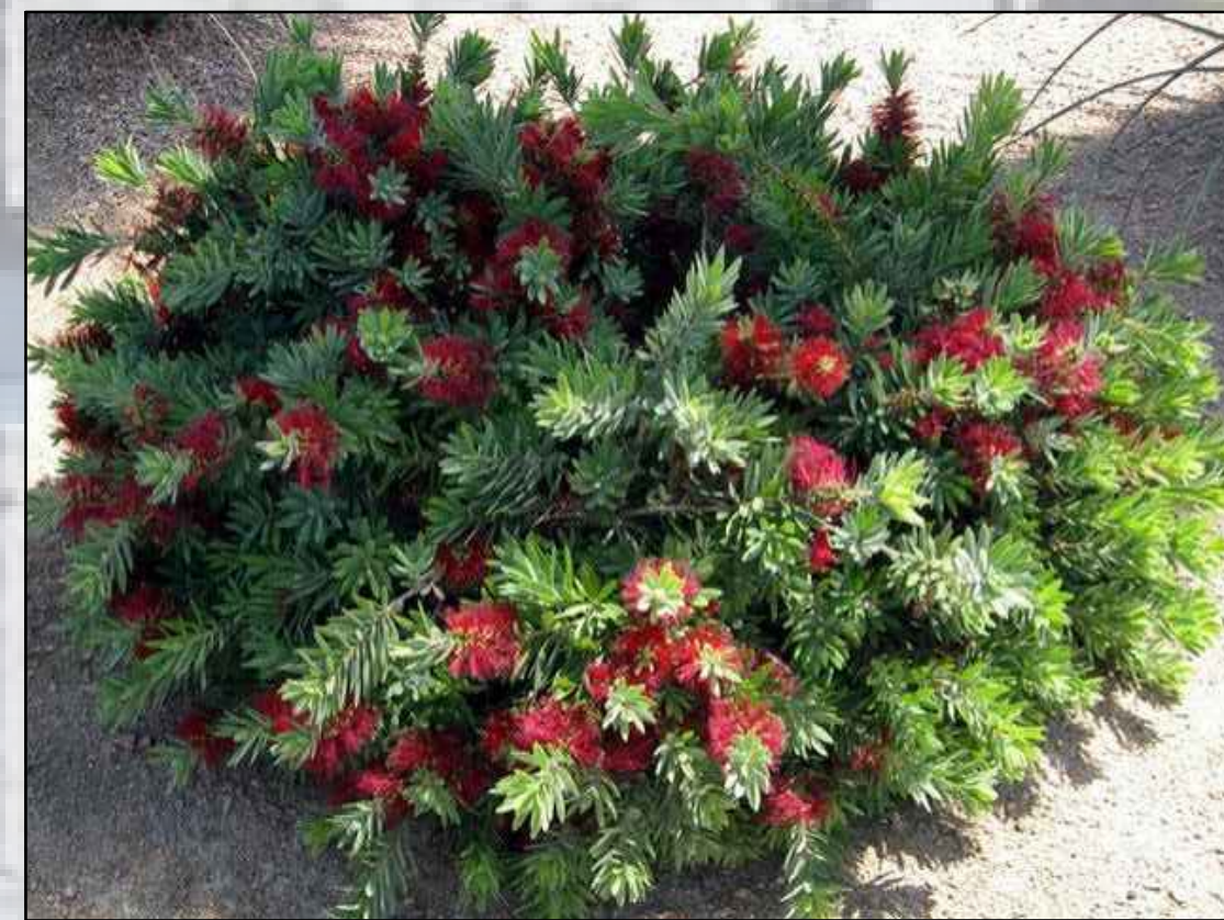
8 CALLISTEMON CITRINUS 'LITTLE JOHN' DWARF BOTTLE BRUSH