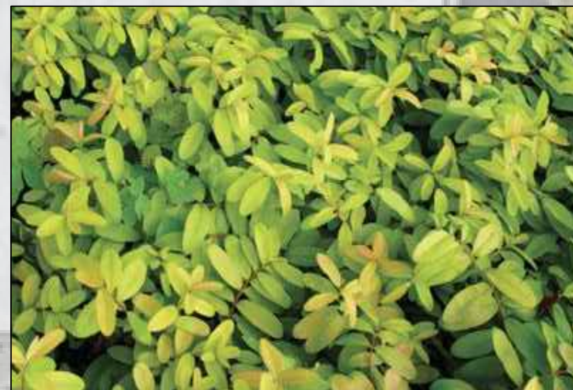
8 HYPERICUM CALYCIUM 'BRIGADOON' BRIGADOON AARONS BEARD