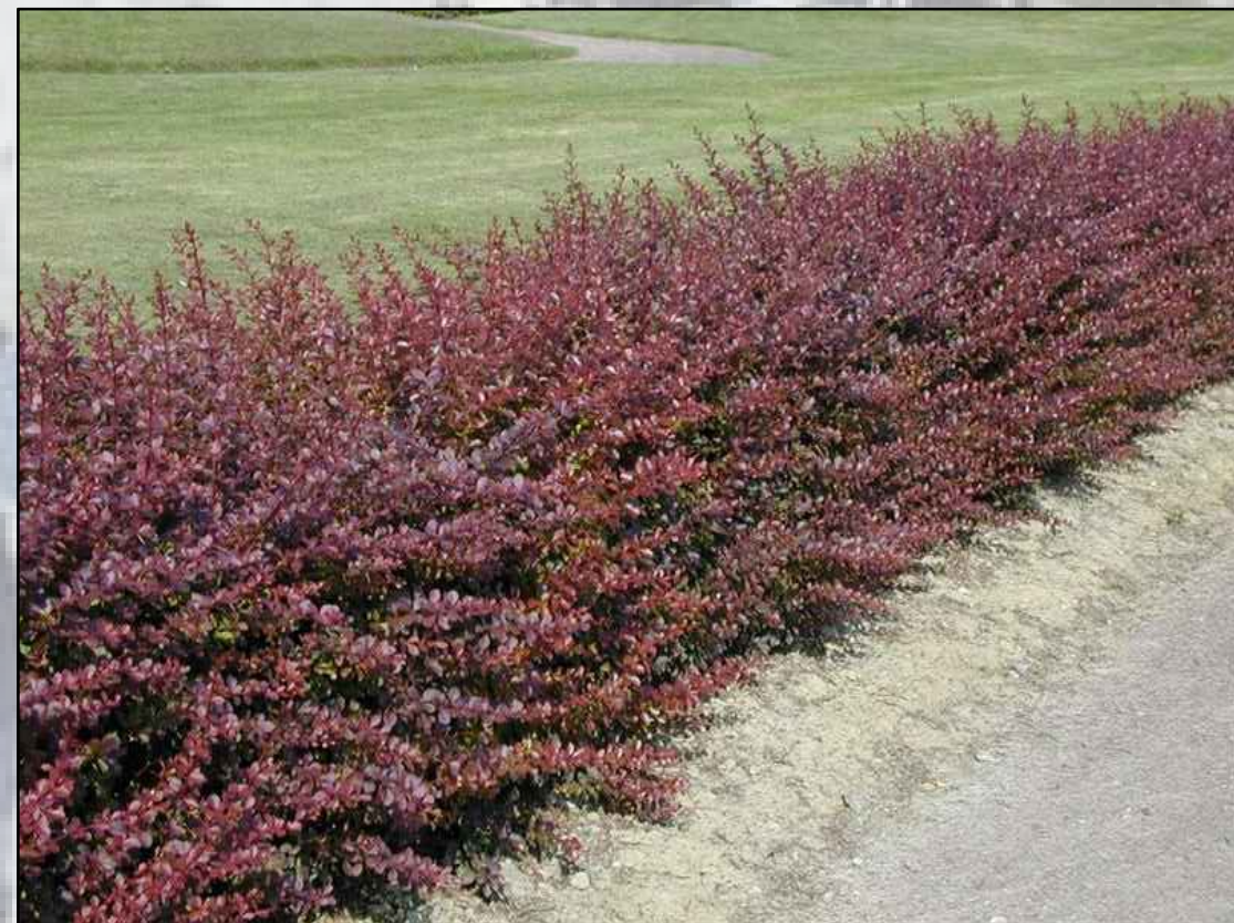
8 BERBERIS THUNBERGII GOLD NUGGET JAPANESE BARBERRY